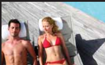
rest & relax